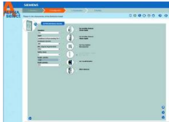
ALPHA SELECT distribution board attributes