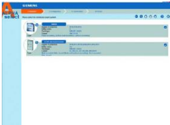
ALPHA SELECT distribution board selection