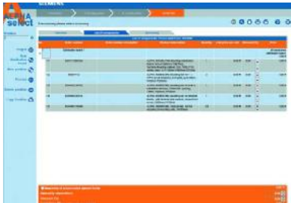
ALPHA SELECT list of components